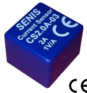
Figure 1. Photo of the CS series current sensor