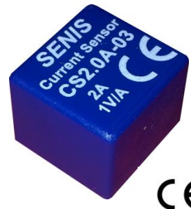
Figure 1. Photo of the CS series current sensor

The CS series current sensor contains a integrated circuit, multi turn coil and some other especially designed parts. Thanks to its unique design the CS series current sensors is capable to measure both a unidirectional and the bidirectional current. As an option it is possible to have the CS current sensor witch can measure only a unidirectional current, in this case sensitivity and an input resistance of the CS current sensor are doubled (this option is available only on the customer request). The rugged mechanical design and its small burden resistance make it useful in almost any application.