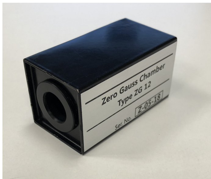
Figure 1. Zero Gauss Chamber type ZG-12-LN

The SENIS Zero Gauss Chamber model ZG-12-LN is a magnetic shielding accessory that is specially designed to support the SENIS ultra-low noise Hall probes used with the high-accuracy Digital Teslameters 3MH5.