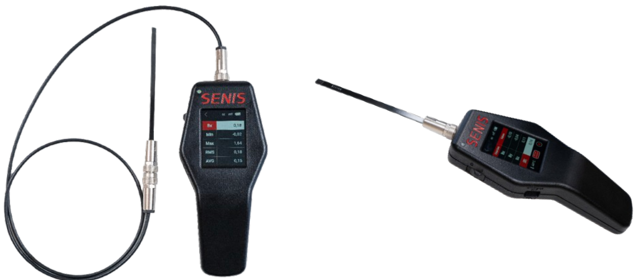
Figure 1: SENIS 3MH1-E Handheld Teslameter with and without extension cable

New dual-usage of the device will be allowed due to the dedicated extension cable, which allows users to unscrew the probe with a holder from the handheld unit and to connect it via the extension cable. This enables flexible usage of the probe in hard-to-reach or spatially constrained environments, effectively turning the device into a handheld teslameter with a remote probe for increased accessibility and versatility in challenging measurement setups.