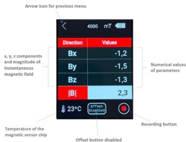
Figure 2: SENIS 3MH1-E Handheld Teslameter measurement tab with Bx, By, Bz and Btotal