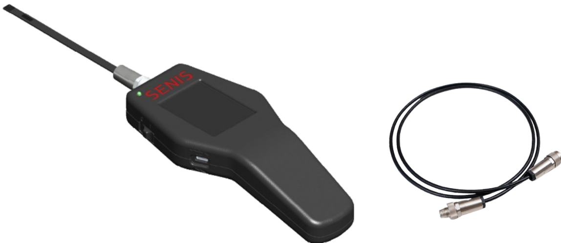
Figure 3: SENIS 3MH1-E Handheld Teslameter and the extension cable