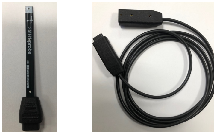
Figure 3: SENIS 3MH1-E Handheld Probe and the extension cable