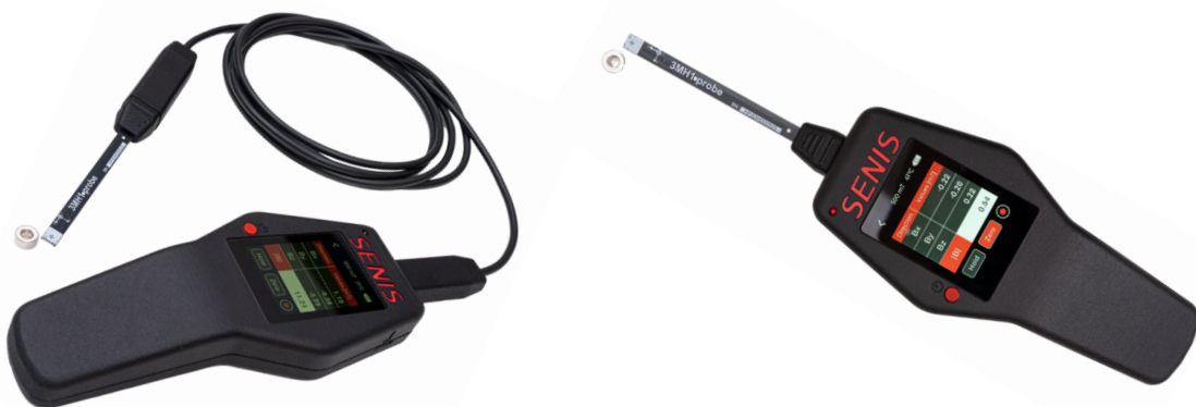
Figure 1: SENIS 3MH1-E Handheld Teslameter with and without extension cable

New dual-usage of the device will be allowed due to the dedicated extension cable, which allows users to unscrew the probe with a holder from the handheld unit and to connect it via the extension cable. This enables flexible usage of the probe in hard-to-reach or spatially constrained environments, effectively turning the device into a handheld teslameter with a remote probe on cable for increased accessibility and versatility in challenging measurement setups.