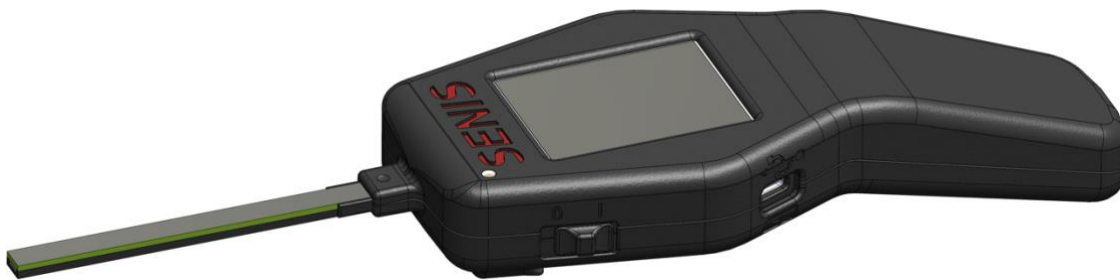
Figure 3: SENIS 3MH1 Handheld Teslameter without the nose cover