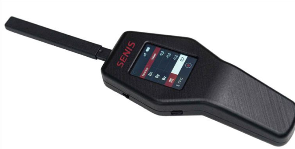
Figure 1: SENIS 3MH1 Handheld Teslameter

Due to unique features of the applied fully integrated 3-axis Hall probe, all three components of the magnetic field ( B_x , B_y , B_z ) are measured simultaneously at virtually same point. It allows users to perform a fast, high-resolution measurement of magnetic flux density of the magnetic fields. The measured values are presented on the device touch-display. The magnetic field sensitive area of the applied Hall probes is within a 100\ \mu\text{m} \times 100\ \mu\text{m} square, which allows measurements of homogeneous and highly inhomogeneous magnetic fields.