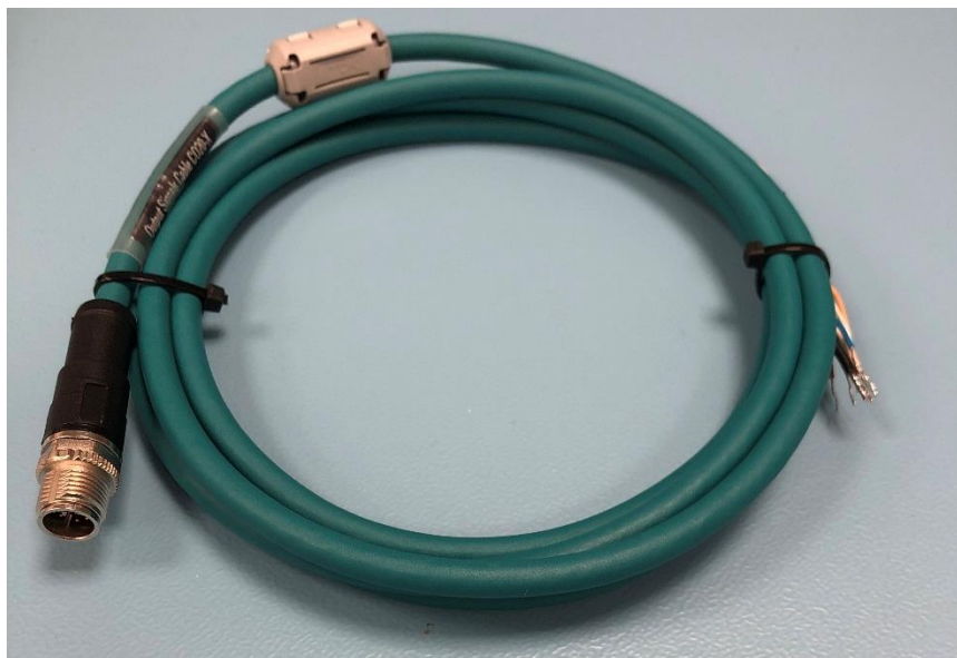
Figure 1: Output Signals Cable CO20-X