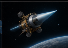
DEEP SPACE PROBES